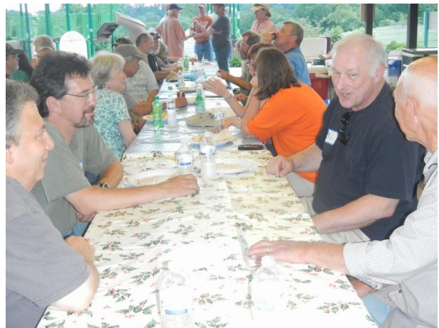
PVFF picnic at Catoctin Nature Center June 11, 2013